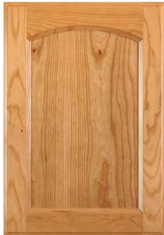
C102 OE3, IE4, FP3/8 in Cherry, Select