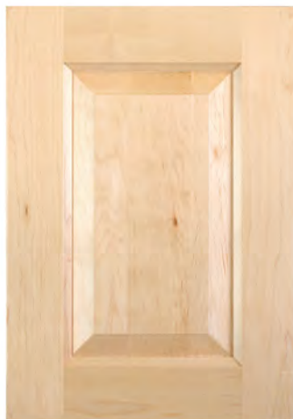
C101Wide OE4, IE4, RP3 in Hard Maple, Select