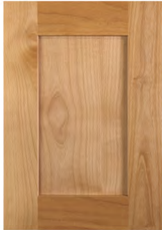
C101Wide OE5, IE2, FP1/4 in Alder, Select

Pair lighter cabinet door designs and materials like those from the top or middle row below, with more detailed, visually heavier designs like those in the middle or bottom row.