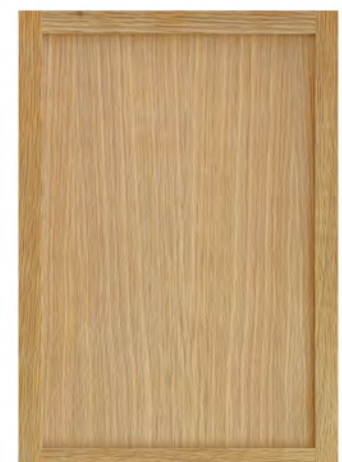
4S 101 in 1" Shaker in White Oak, Rift