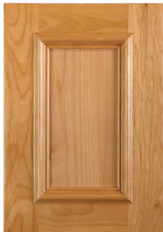
C101Wide OE4 AIM2 FP3/8 in Alder, Select