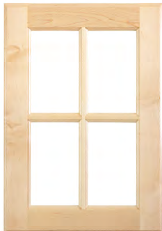
C101 Glass 4Lites OE8, IE1 in Hard Maple, Select