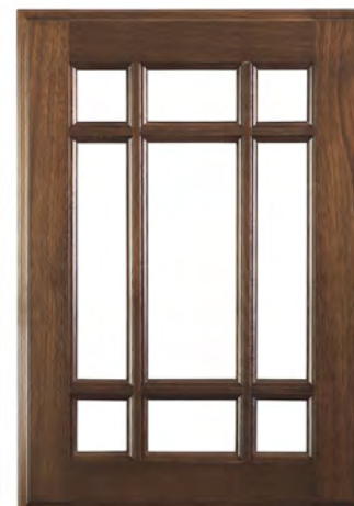
C101 Glass 9 Lites (special placement) OE9, IE1 in Walnut, Select