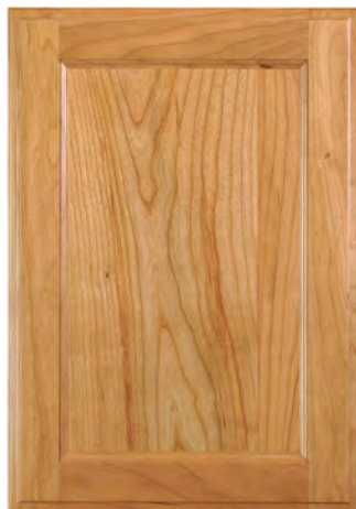
C101 OE9, IE3, FP1/4 in Cherry, Select