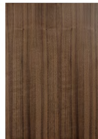
1.5mm Edgeband in Walnut Veneer