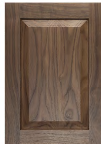
C101 OE5, IE9, RP6 in Walnut, Select