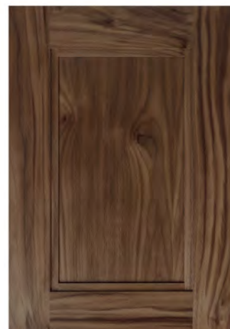
C101 Wide OE5, IE14, FP1/4 in Walnut, Select