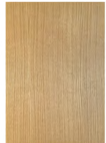
1.5mm Edgeband in White Oak, Rift Veneer