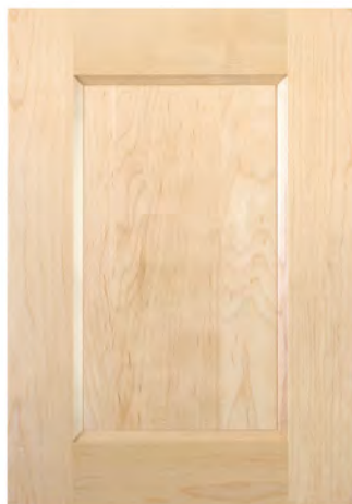
C101 Wide OE4, IE4, RP3 in Hard Maple, Select