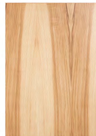
1.5mm Edgeband in Hickory Veneer