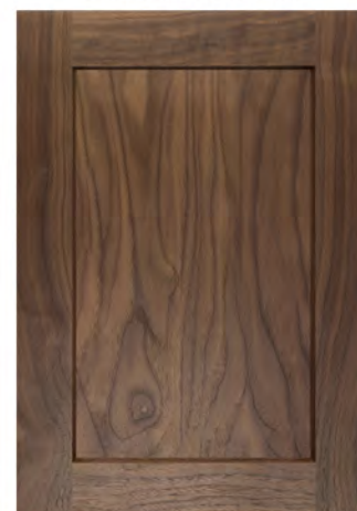
C101 OE5, IE9, FP3/8 in Walnut, Select