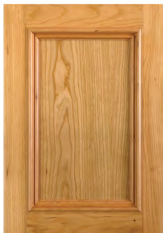
C101 OE5, AIM1, FP1/4 in Cherry, Select