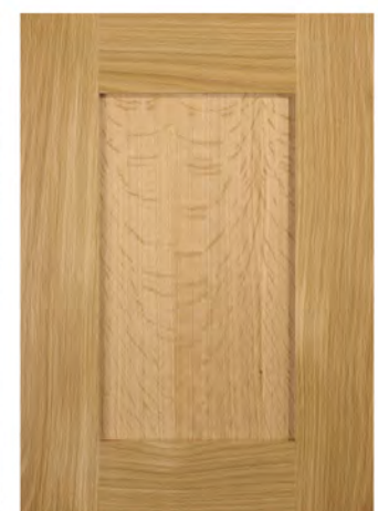
C101 Wide OE5, IE5, FP3/8 in White Oak, Rift