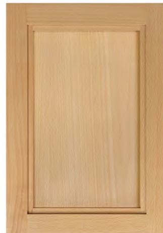
C101 OE5, IE14, FP1/4 in Beech, Select