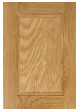
C101 Wide OE5, IE14, FP1/4 in White Oak, Select