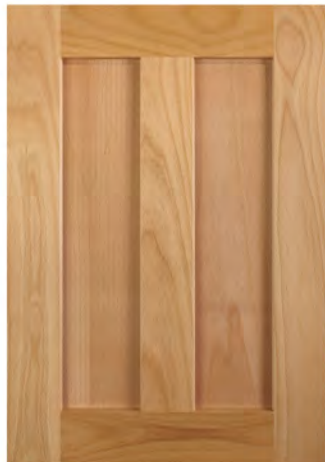
C201 Wide OE5, IE2, FP1/4 in Alder, Select